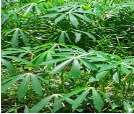
Tivoli Cassava Project