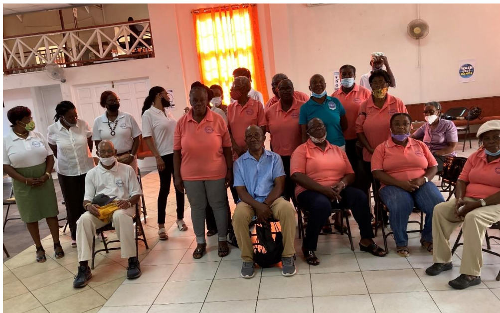
Members of St. George's Particular Council