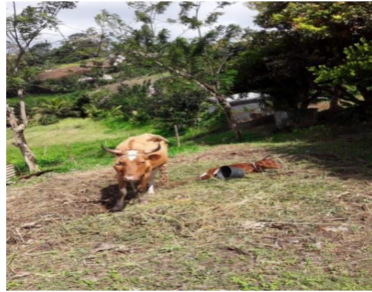
Byland Cow Project